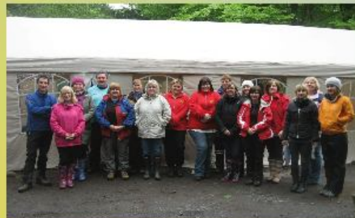
Forest School level 1 participants on the recent course at Craufurdland Estate