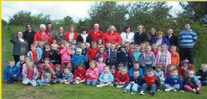
Onthank Nursery at the press release of the start of 'The Foxes' community woodland improvements project and forest school area development.