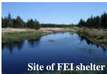
Site of FEI shelter