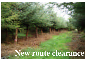
New route clearance

The Ayrshire Forest Cluster is considering the feasibility of holding an event to promote traditional craft skills & methods, possibly in the Autumn / early Winter of 2007, at a woodland site which offers materials, space and access for activities such as charcoal burning demonstrations, green woodworking, weaving, traditional fence construction etc. We would welcome comments and any initial indications of potential involvement.