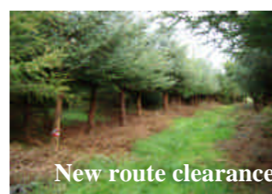
New route clearance

We are working with Barr Primary School and Careers Scotland to develop an education & learning trail within the site, located near the new car park area.