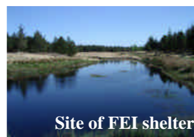
Site of FEI shelter